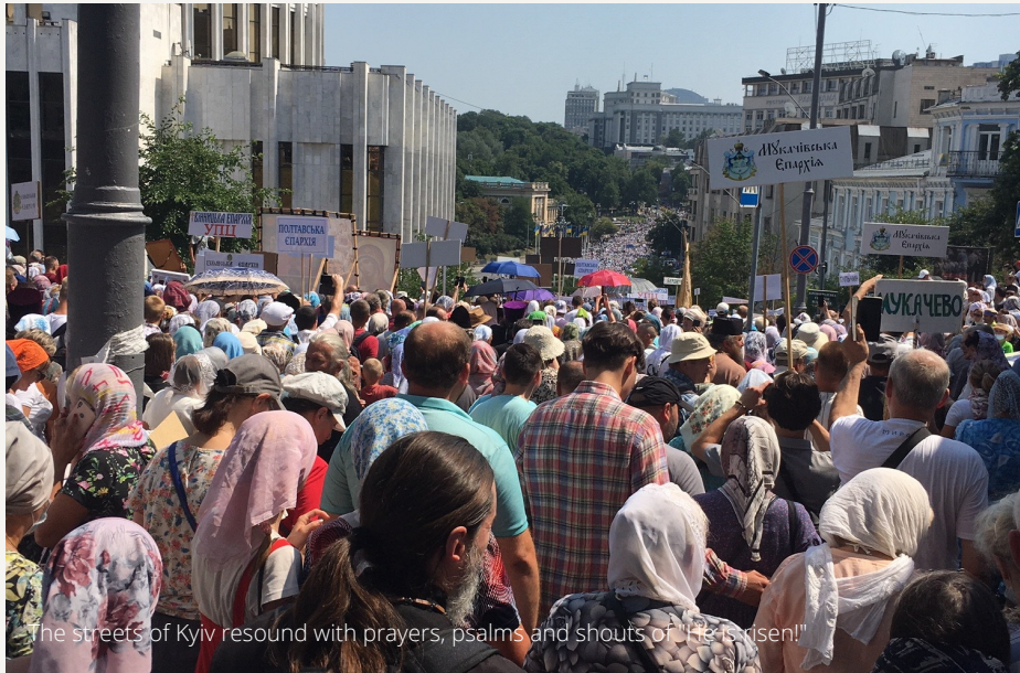
The streets of Kyiv resound with prayers, psalms and shouts of "He is risen!"