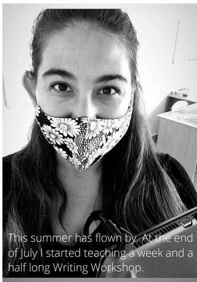
This summer has flown by. At the end of July I started teaching a week and a half long Writing Workshop.

One of my favourite moments though was at the end of class Monday. I had dismissed the students, one was starting to pack up, when the other said, "Wait. Are we done for today?!" "It is 11:27am," I pointed out, "and class ends at 11:30am." "Time flies when you're having fun!" the other student chimed in.