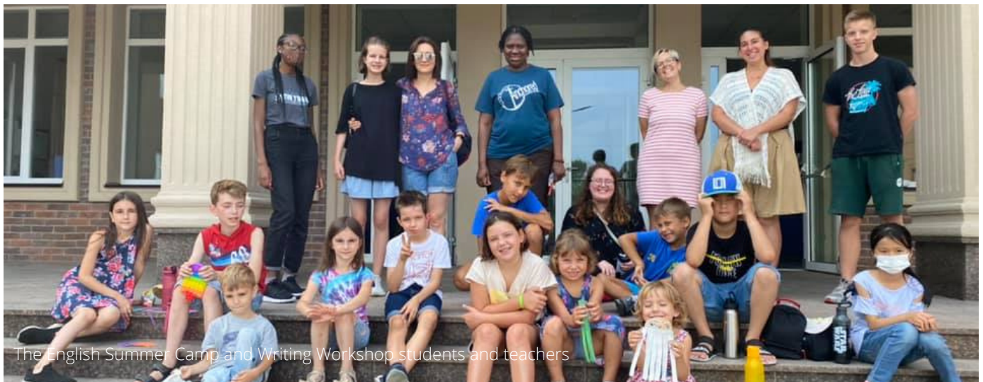
The English Summer Camp and Writing Workshop students and teachers